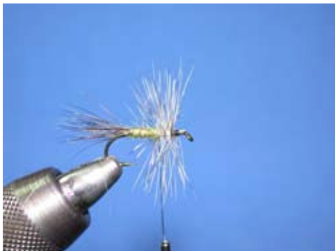
3. Then wrap your hackle.