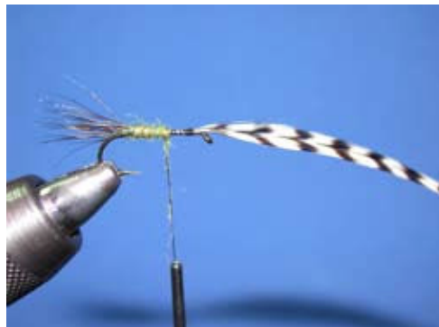
2. Tie the body and tail.