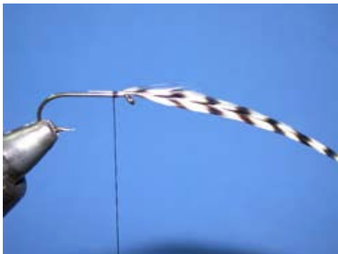
1. First, start your hackle in reverse.