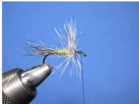
4. Last, wrap the thread through the hackle and form the head. This can be used for both dry and wet flies.

• It would be most helpful when submitting picture's or photograph's for the club newsletter that you include a short writeup that contains names, place, subject or other information you feel will make it more interesting for the reader and make my job alot easier. Thank You.